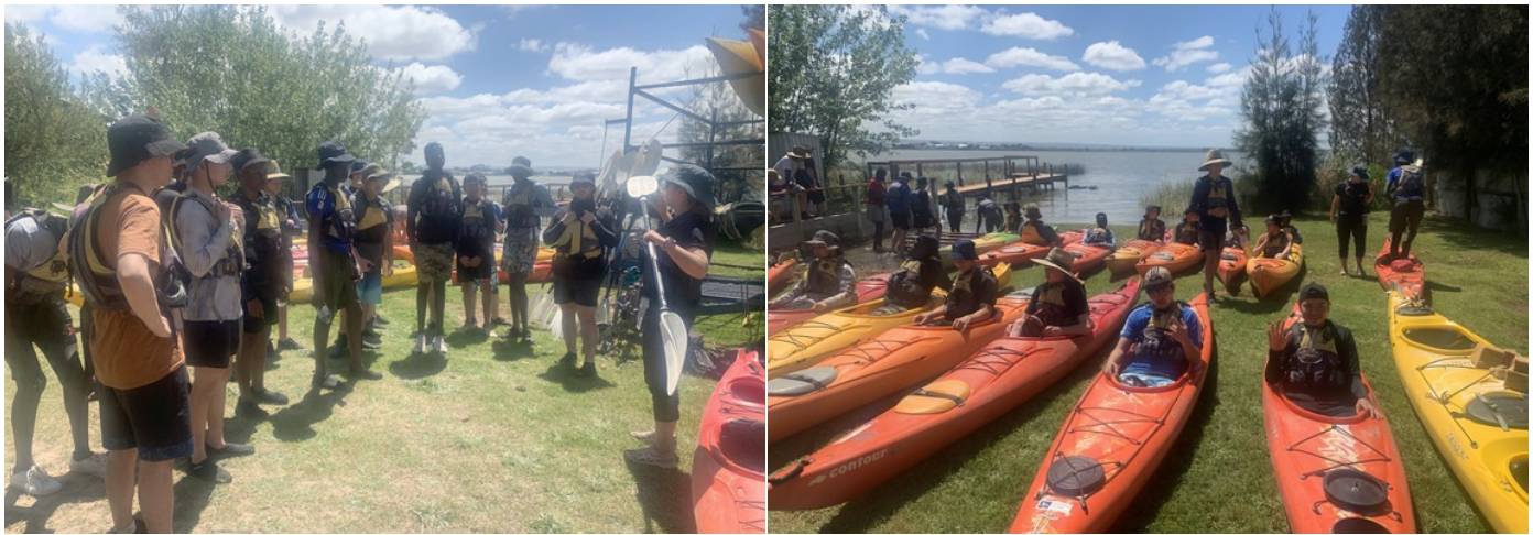
12.11.21 Senior School