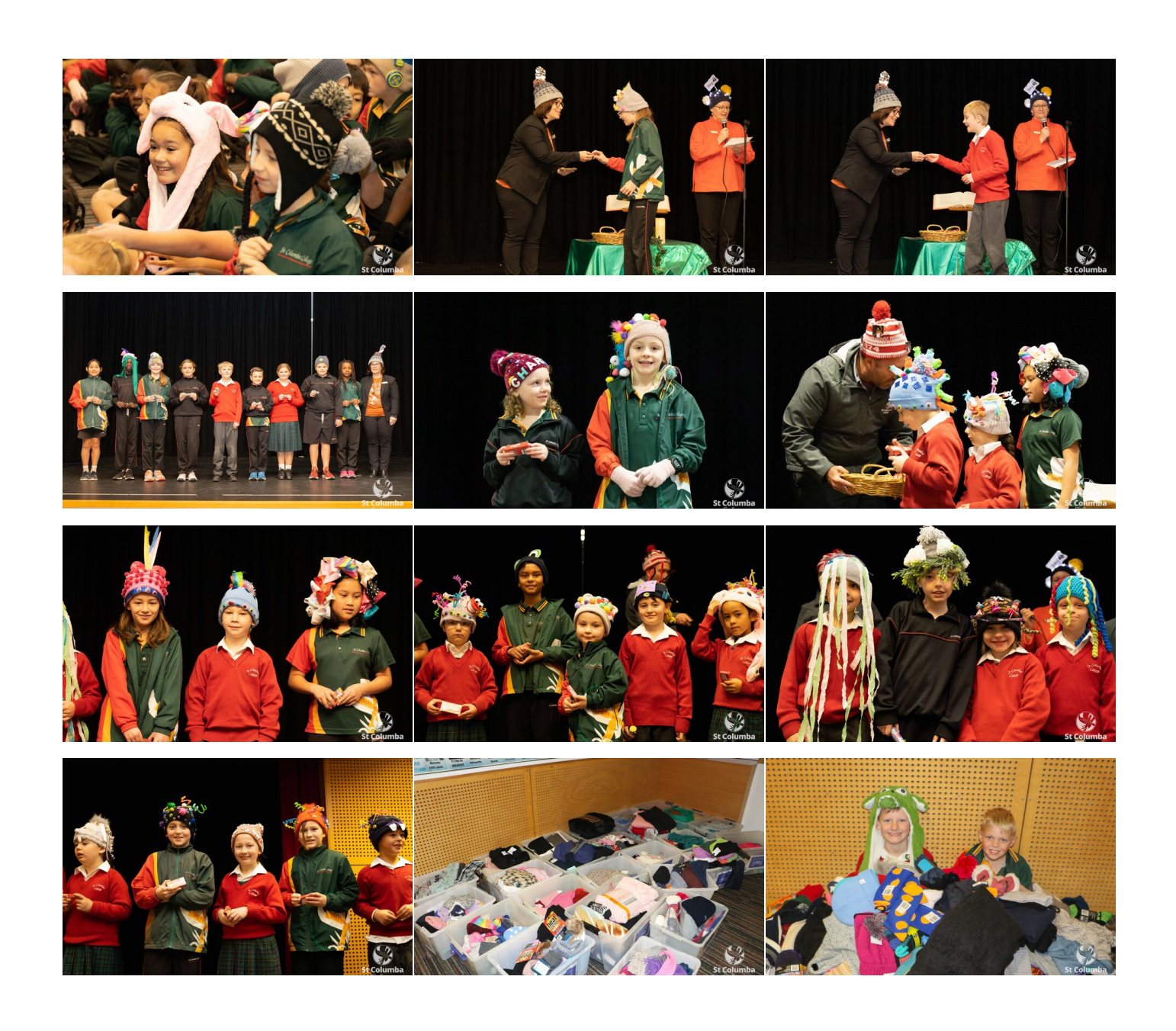
<sub>06.07.22</sub> Junior School