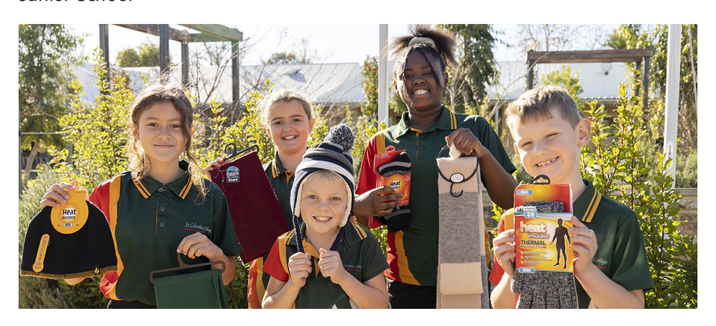
Term 2 has been an exciting and busy time of learning for our students, and we are thankful for the wonderful opportunities that have