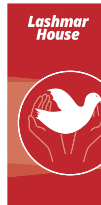
Lashmar (Red): Lilla Lashmar was martyred in 1942 for her courage and dedication to social justice for people who were disadvantaged.