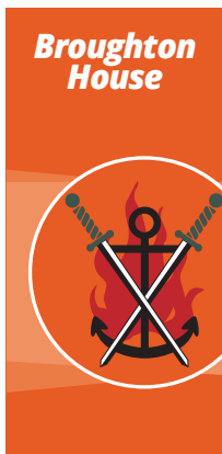
Broughton (Orange): William Broughton was the first Anglican Bishop in Australia.